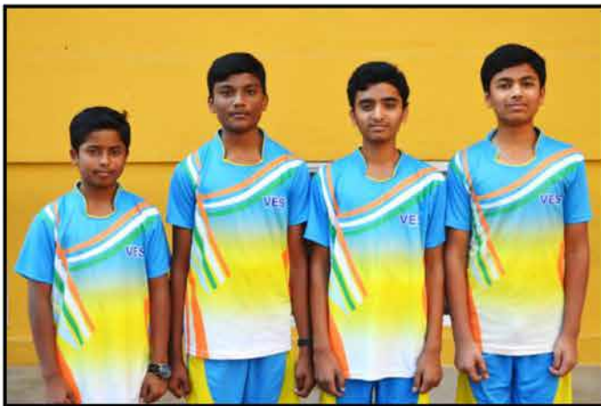
Under 17 Boys State Level Table Tennis Team