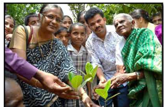
Great environmentalist Padmashree Salumaradha Timmakka and our like-minded Administrator