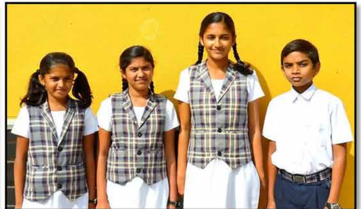
Under 14 & 17 State Level Chess Participants