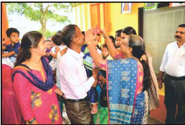
Our beloved Administrator welcoming the little ones on their first day of school.