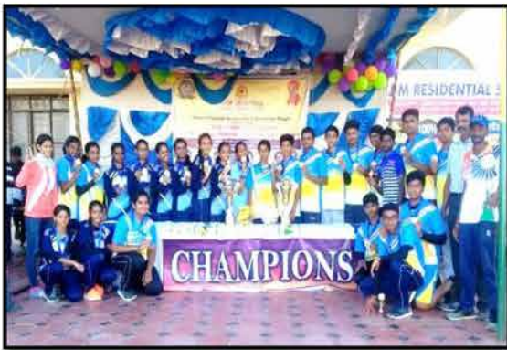
Under 17 boys & girls Amateur Netball Association State Level Gold Medallists