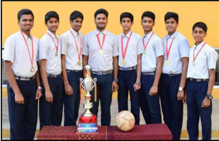
Under 17 Boys State Level Netball Gold Medallists