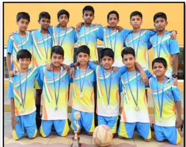
Under 14 Boys Football District Level Silver Medallists & Division Level Participants