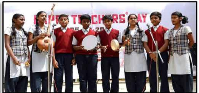
Entertaining the Teachers with a lovely song

Vijaya School celebrated Gandhi Jayanti on October 2 nd to commemorate the birthday of Mohandas Karamchand Gandhi, the father of our nation and a pioneer of truth and non-violence. The programme began with the morning assembly highlighting the significance of the day. A devotional ambience prevailed as the programme started with "Raghupathi Raghava Rajaram" and other bhajans dedicated to Gandhiji.