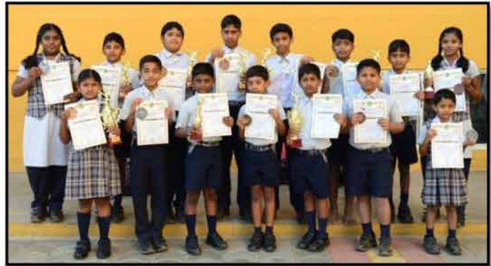
National Level Karate Medallists