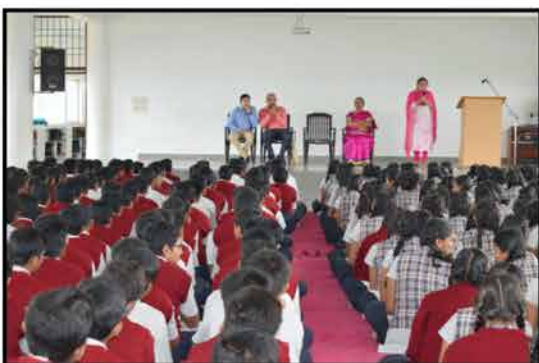
Life skill classes by Buoyancee Team, Bengaluru.