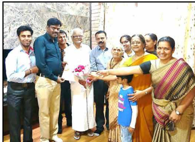
Wishing our Beloved President on his 90 th Birthday.