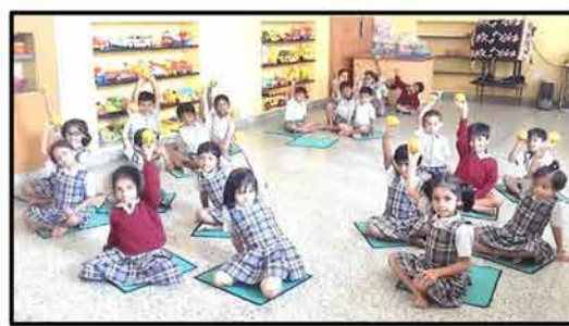
Moments of fun and creativity