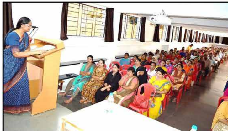
Our Administrator interacting with the parents on learning disabilities