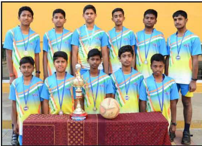
Under 14 Boys State Level Netball Team Silver Medallists