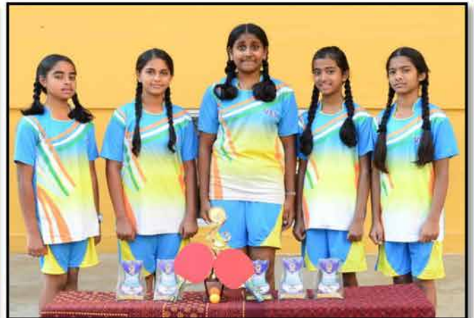
Under 14 Girls State Level Table Tennis Team