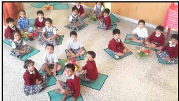
Learning the skills of making beautiful flower bouquets.