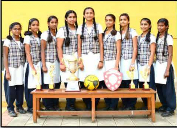
Under 17 girls District level athletic champions

Our students have won 125 prizes in various sports competitions, to be precise 21 prizes in the Division level sports, 104 prizes in the State level sports, 26 representing Karnataka at the National level and 9 winning the prizes in the National level sports competitions.