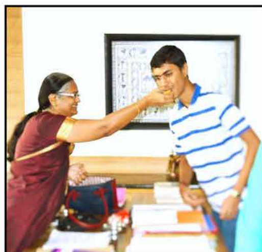
A touch of sweetness from our Administrator