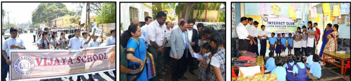
Vijaya Students joining hands with the forum for Environment protection demanding for Global Climate Crisis Declaration and presenting a memorandum to D.C.