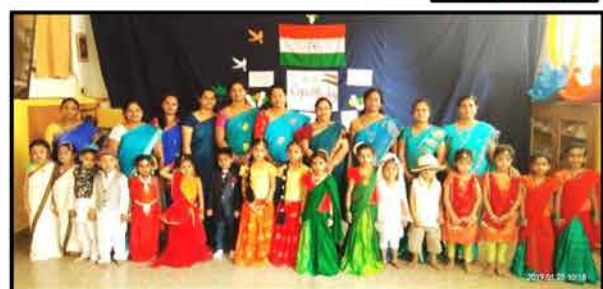
Our little ones celebrating festivals with lots of enthusiasm and gusto.