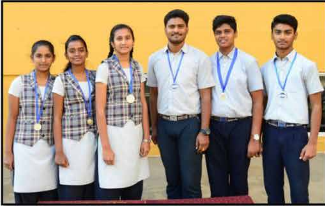
Under 17 Boys & Girls National Level Netball Silver Medallists