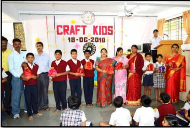
Gifting Craft kits to our primary children