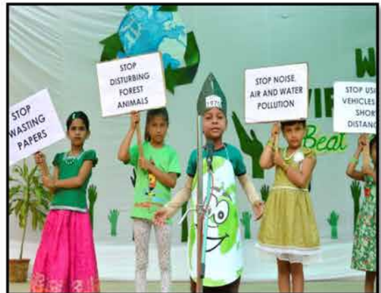
Slogans highlighting the significance