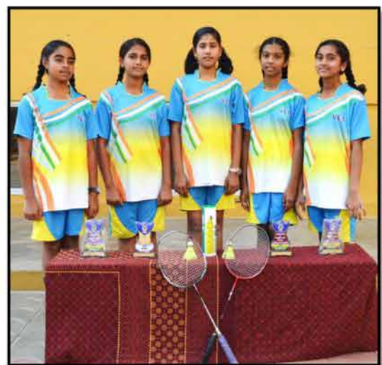
Under 14 Girls Division Level Badminton Team