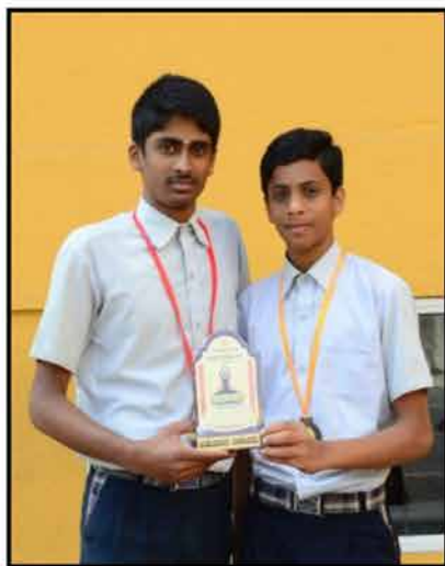
Under 17 Boys Yoga State Level Participants