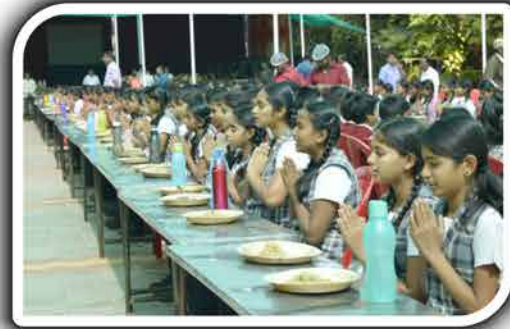
December 22, 2018: Samoohika Bhojana at the close of Vijayothsava