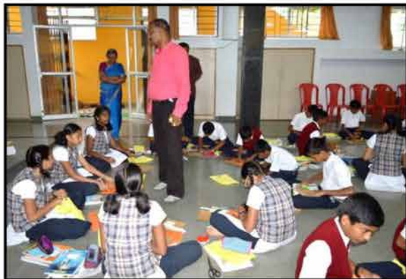
Conducting Science workshop for High school children