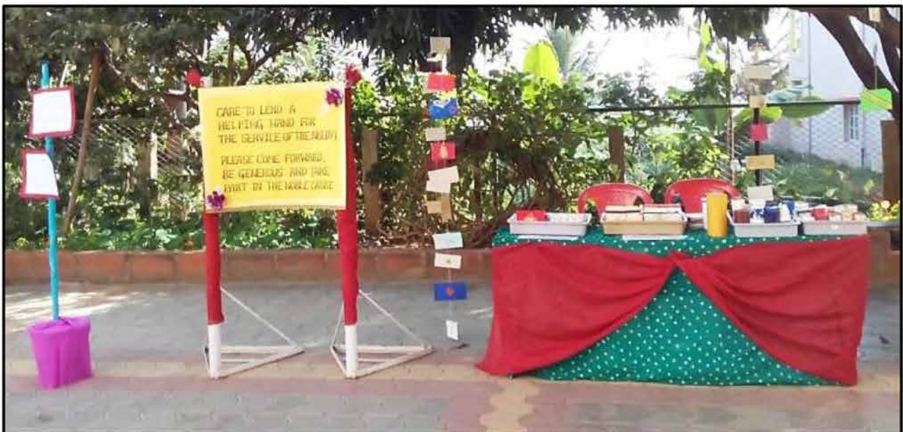
Children made beautiful envelopes and boxes which were put on sale for the cause of the needy