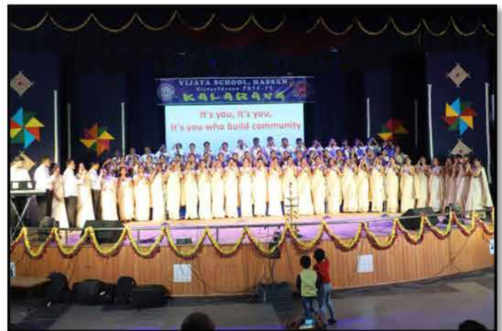
A community song - Curtain raiser for KALARAVA by Vijaya Staff