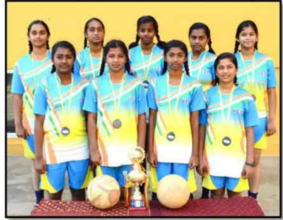
Under 14 girls Netball State Bronze Medallists