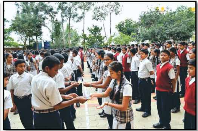
Kindling the light of wisdom

We have to acknowledge that nature is the provider of everything. Therefore it is our prime duty to contribute positively to nurture our environment. As a humble contribution, our Institution has adopted M.G. Park, Vidyanagar which was in a dilapidated condition and renovated the same by planting flowering plants, trees and installing gym equipments and play things. Now it has turned out to be a beautiful park for morning walkers and for the children to play. The park was looking magnificent with blooming yellow Marigold flowers during Deepavali. The park was illuminated on the occasion of Deepavali which was spectacular and earned accolades from the public.