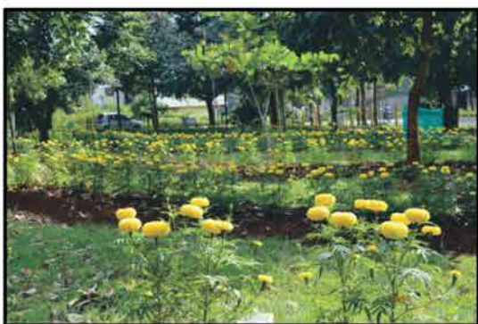
A blossoming M.G. Park with Marigold

We have to acknowledge that nature is the provider of everything. Therefore it is our prime duty to contribute positively to nurture our environment. As a humble contribution, our Institution has adopted M.G. Park, Vidyanagar which was in a dilapidated condition and renovated the same by planting flowering plants, trees and installing gym equipments and play things. Now it has turned out to be a beautiful park for morning walkers and for the children to play. The park was looking magnificent with blooming yellow Marigold flowers during Deepavali. The park was illuminated on the occasion of Deepavali which was spectacular and earned accolades from the public.