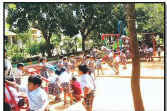
Children enjoying a day at M.G. Park