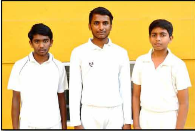
Under 17 Division Level Cricket Players