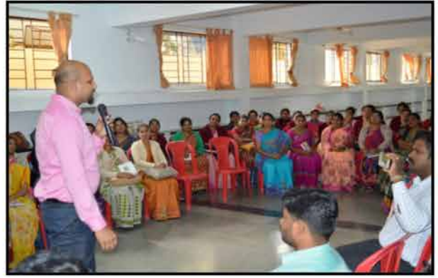
An interactive session with teachers by Buoyancee