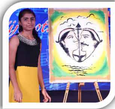
The skill of spot drawing