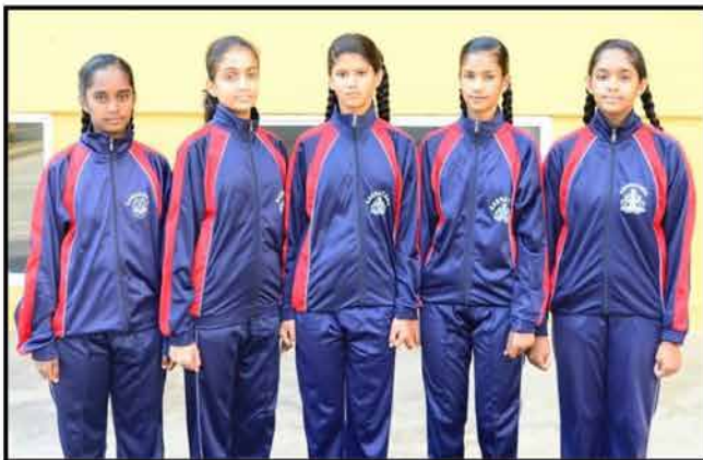
Under 17 Girls National Level Netball Team Participants