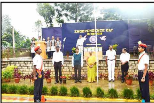
Celebrating Independence Day