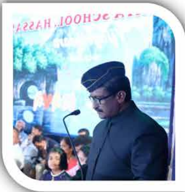
Col. K.S. Natesh inspiring the youngsters to serve our nation