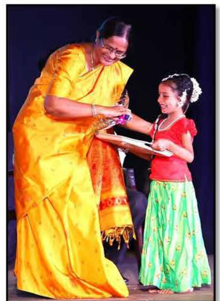
Welcoming with a sweet smile