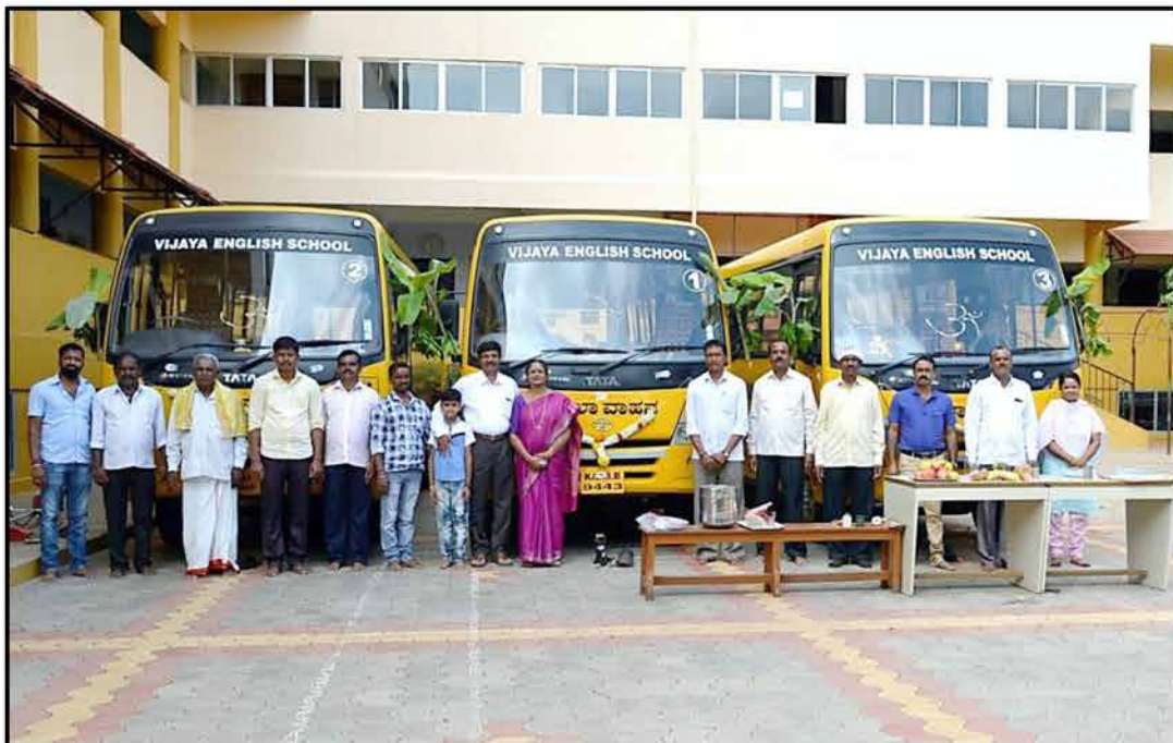
Ayudha Pooja Celebration