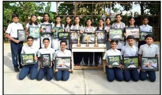
Winners of various competitions conducted by Malnad Eco Club