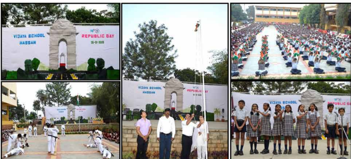
Republic Day Celebration

70 th Republic Day was solemnly celebrated in our school. India is a great country that stands for “Unity in Diversity” where people of different religions and culture live together in peace, harmony and brotherhood. The heart of every Indian fills with pride when one sees the National Flag being unfurled on Republic Day. Colourful cultural activities were performed by our students. Speakers encouraged every individual to become a good citizen so as to build a good nation.