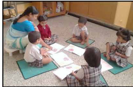
Experiencing hands-on activities