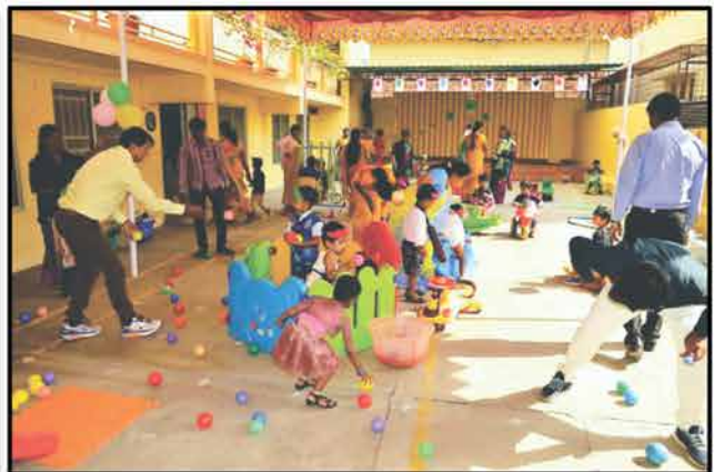
New Vijaya kids enjoying on the opening day