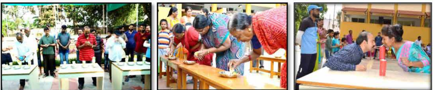
Ready for a challenge.

We value the continuous support and cooperation of our parents. Their collaboration and encouragement accompany us always. The parents and grandparents of our children enjoyed a day of fun and frolic which reminded them of their childhood days.