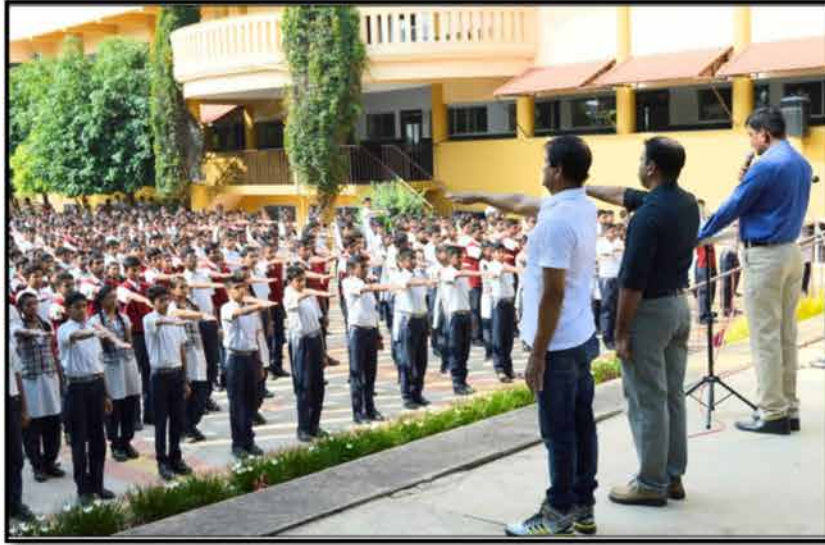
Observing National Unity. H.M administering the oath