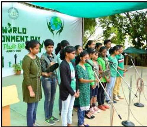
Singing with the tune of nature