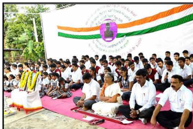
Celebrating Gandhi Jayanti

Vijaya School celebrated Gandhi Jayanti on October 2 nd to commemorate the birthday of Mohandas Karamchand Gandhi, the father of our nation and a pioneer of truth and non-violence. The programme began with the morning assembly highlighting the significance of the day. A devotional ambience prevailed as the programme started with "Raghupathi Raghava Rajaram" and other bhajans dedicated to Gandhiji.