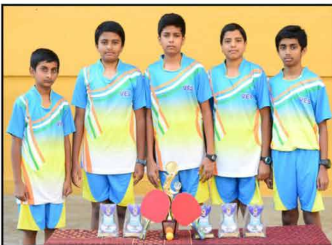
Under 14 Boys State Level Table Tennis Team