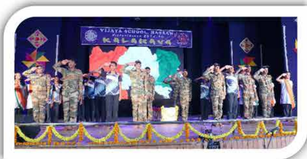
A big Salute to the soldiers