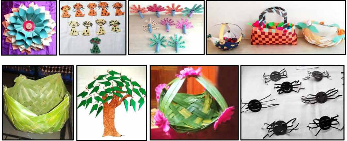
Creative Works of our Children