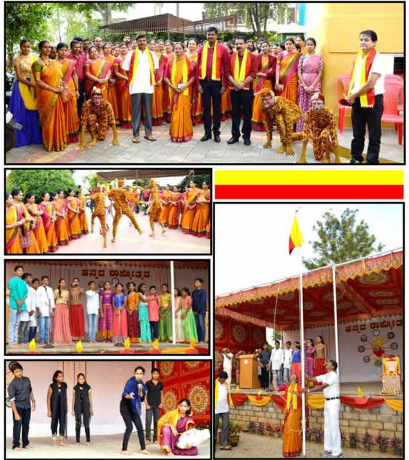
Celebrating Kannada Rajyothsava

Kannada Rajoytsava, the birthday of Karnataka is celebrated with great fervour all over the world where Kannadigas are present. In 1956 all the Kannada language speaking regions of South India were merged to form Karnataka State. It was a colourful celebration in our school. The dignitaries were welcomed in a traditional manner. We hosted varieties of programmes to remember the richness of our culture.