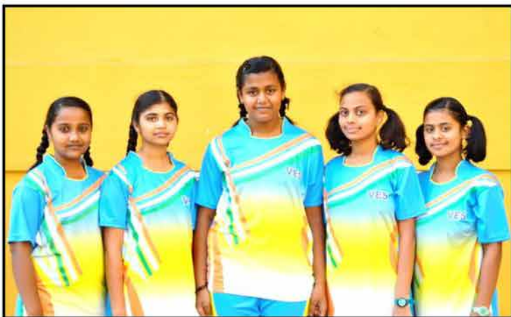
Under 17 Girls Table Tennis Team