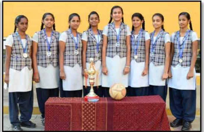
Under 17 Girls Netball State Silver Medallists