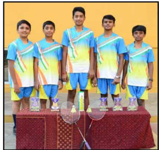
Under 17 Boys State Level Badminton Team