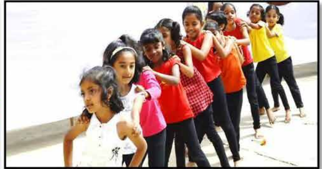
Engaging the Teachers with a cute performance