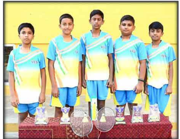
Under 14 Boys Division Level Badminton Team