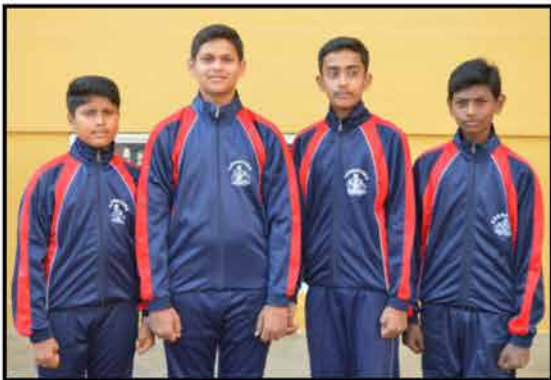
Under 14 Boys National Level Netball Participants