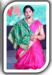
Fantastic performances by parents at Kalarava