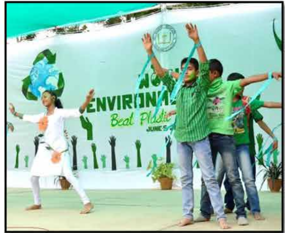
Spreading the message through a dance