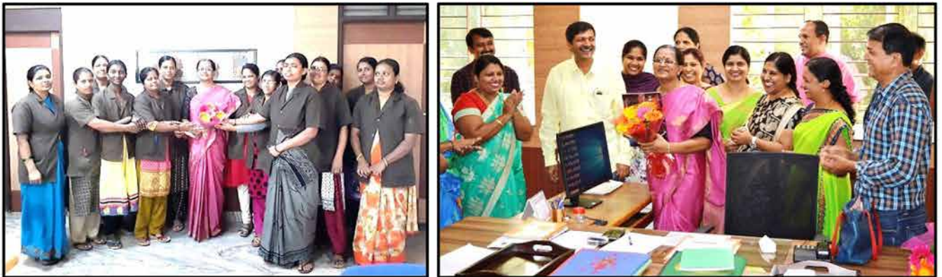
Being proud to be a woman - Women's Day - 2019