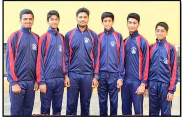
Under 17 Boys National Level Netball Team Participants