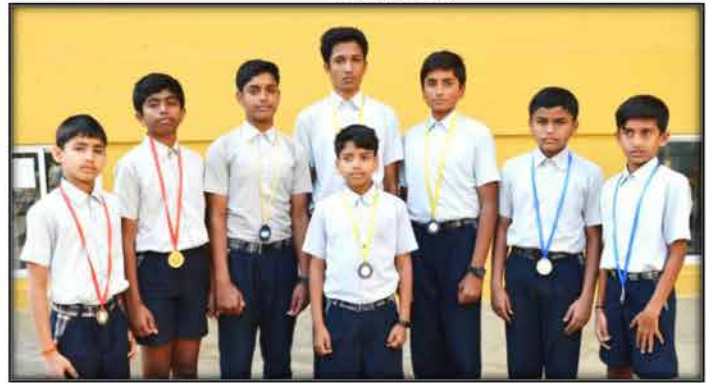
Under 14 & 17 State Level Swimming Participants