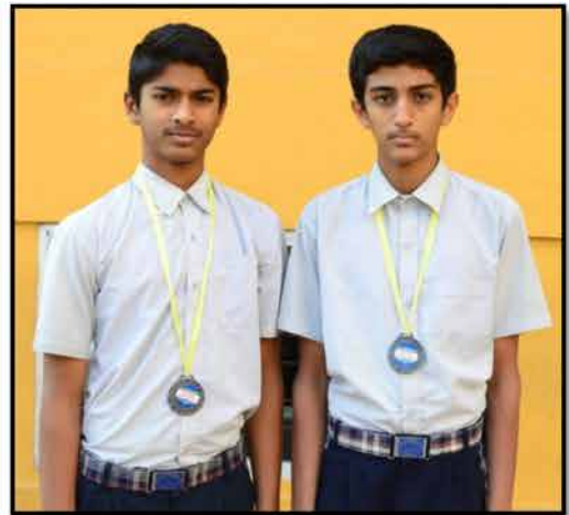
Under 17 Boys National Level Bronze Medallists