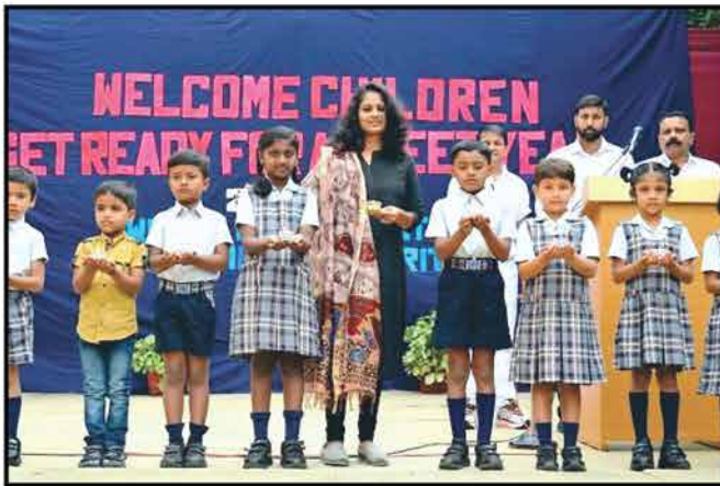
Sharing the light of knowledge with delight