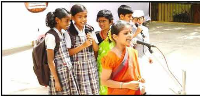
Playing the role of a teacher