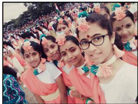
Children at Stadium for Independence Day Programme