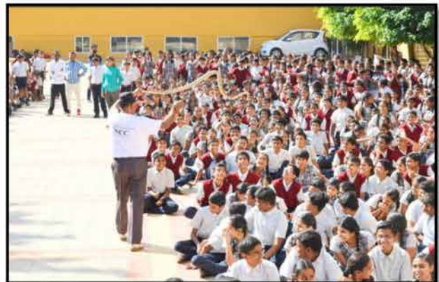
Snake Sheshappa demonstrating the children about 'Myths on Snakes'