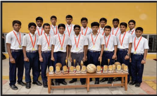
U-17 Boys Football team- District level winners