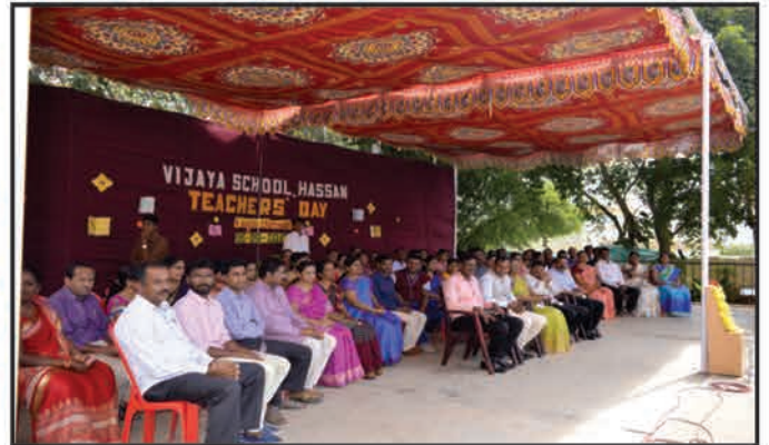
Students extending their gratitude to their teachers