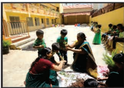
Let's grow trees for a better tomorrow