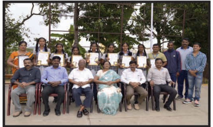
U-17 Girls Netball team National level Bronze medalists