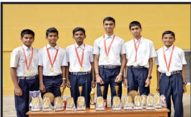
U-17 Boys State level Table Tennis Participants