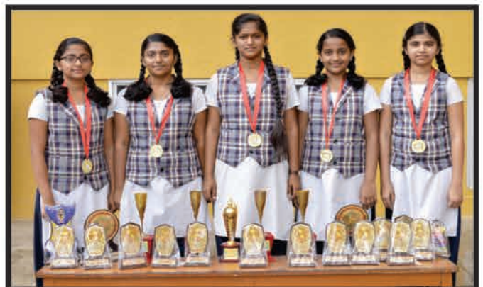
U-17 Girls State level Table Tennis Participants