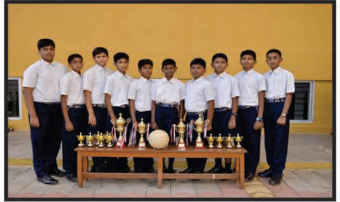
U-14 Boys Netball team State level winners