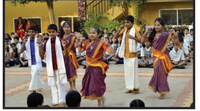
Children exhibiting Indian cultural dance