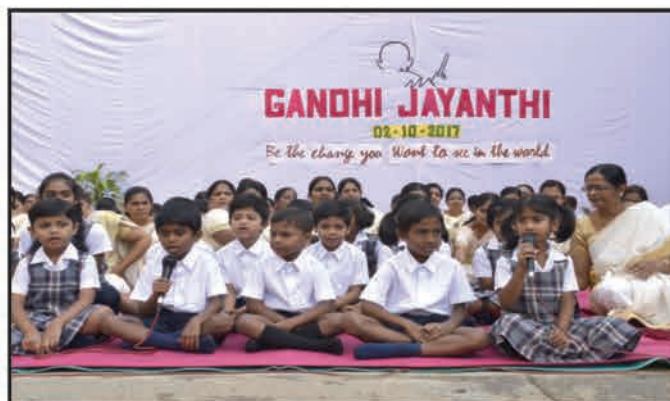
Children reciting Sarvadharm Prarthane

We celebrate Gandhi Jayanthi to remember the sacrifices, morals and teachings of the Father of our Nation Mahathma Gandhi.