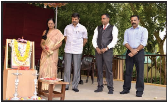
The dignitaries on the occasion of Kanakadasa Jayanthi

Our school organized The Children's Trade Fair on 06.11.2018 to help the children acquire the skills of everyday transactions in real life situations. Children understood the concept of profit and loss. Around 134 stalls were installed by 180 students under six categories. Fruits and Vegetables, Provisions, Stationery, Fancy Stores and Cosmetics, Pet Shop and confectionary were the different categories under which students sold their commodities.