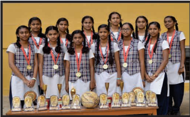
U-17 Girls Netball team State level winners