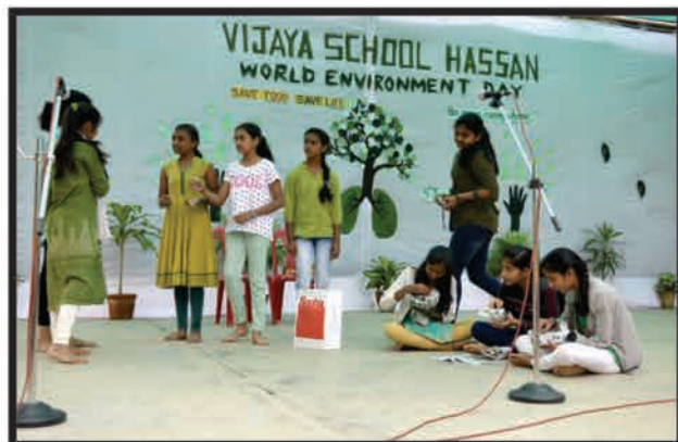
Children enacting a skit about saving the environment