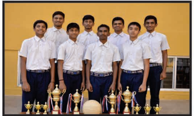
U-17 Boys Netball National level participants