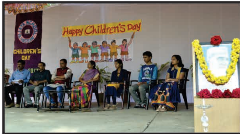
Students sharing the dais

Children are the most beautiful people of the world. They are the keys to our lives of happiness and contentment. We celebrated Children's day by hosting a programme to entertain the children. Our student representatives had the privilege of sharing the dais with the dignitaries.