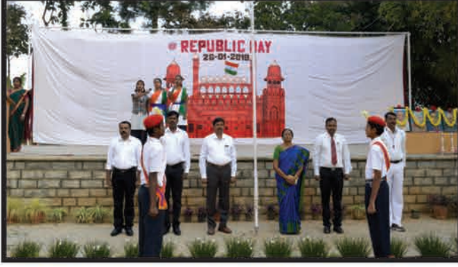
The dignitaries at Republic Day celebration

Republic Day is one of the most significant national events. In our school we lay more emphasis on patriotism, religious tolerance and national integration. We highlight all this during our national festivals.