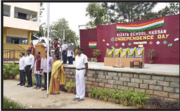
Celebrating Independence Day