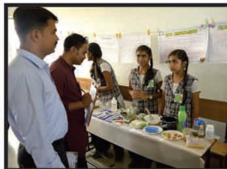
Students with their science models