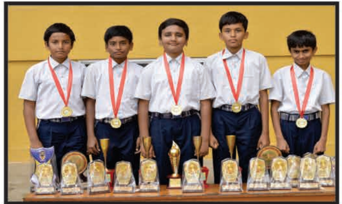
U-14 Boys Badminton team Division level winners