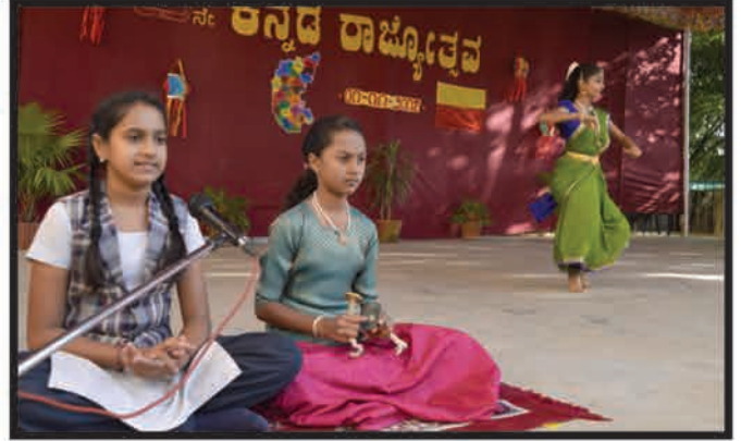
A musical presentation