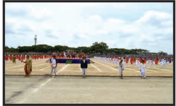
Children performing a dance programme about Freedom Movement in District Stadium