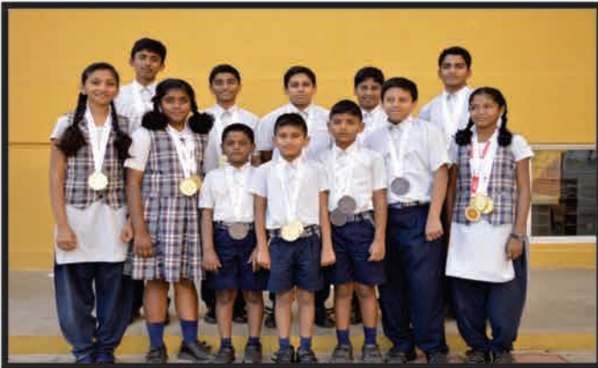
Karate National level Medalists