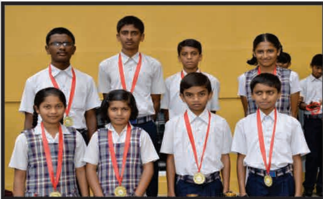
Division level Yoga participants and State level Chess players