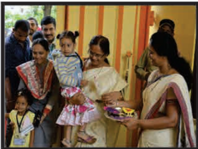
A warm welcome to the abode of learning

The classrooms are designed as learning studios that provide not just meaningful experiences but also take our students on a wonderful voyage towards knowledge. The rendition of early learning skills has provided the children with several advantages. The children go to the first grade with a firm grasp of early reading and writing skills that give them a very strong foundation for Primary Education. We have seen amazing results in students with respect to English communicative skills, numerical aptitude and social skills.