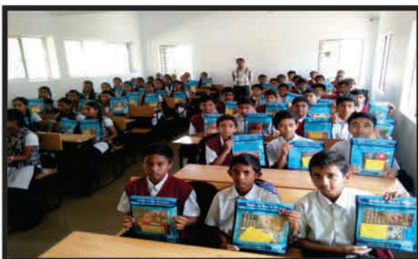
Children hold their heads high with pride to have lovely books gifted by the School Management