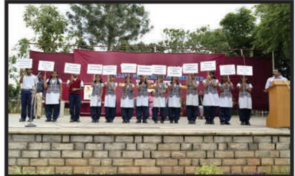
Children holding placards heralding the benefits of reading good books