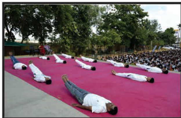
A fine display of yogasanas at school