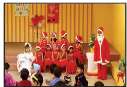
Santa Claus with Tiny Tots