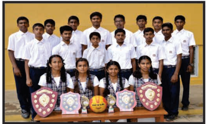
District level champions in Athletics