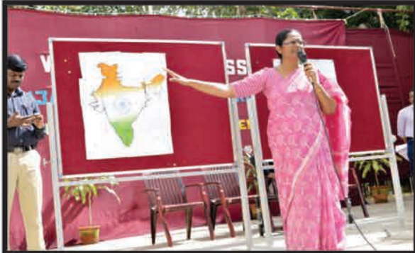
Administrator asking the students a thought provoking question

We have started Readers Club to consistently cultivate the reading habit among the children. In support of this our school management has gifted a book to each child from class I to X.