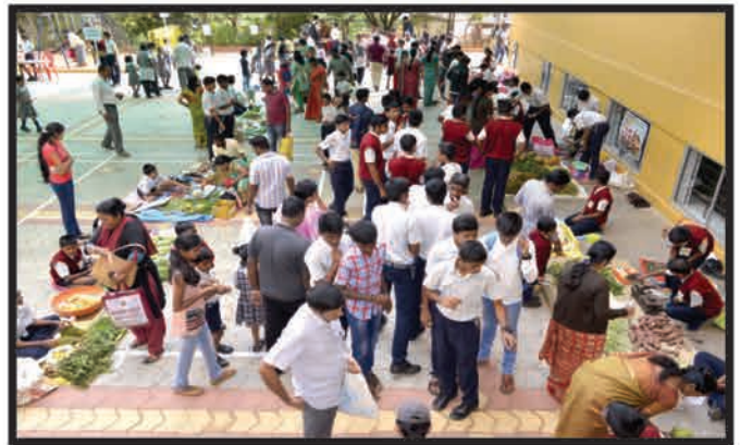
Children selling their commodities in Children's Trade Fair