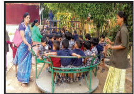
Keep playing to speed up your learning...