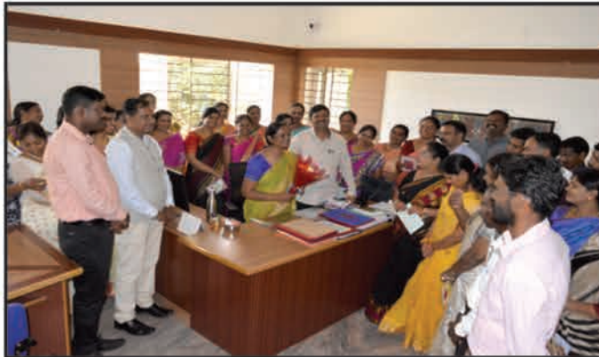
'Teachers' teacher' being greeted

People all over the world celebrate Teachers' Day to pay tributes to the contributions made by the teachers to the student community and society at large. We celebrated the day as 'Self Governance Day' by distributing the roles of teachers to a few students of class X. The responsible students who played the roles of their teachers, engaged the students for the first few hours in the classrooms. It was a great feeling for the students as they got the first-hand experience of the challenges faced by their teachers.