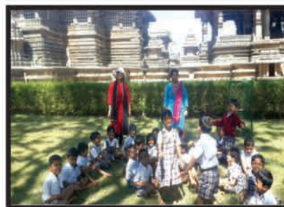
On a picnic