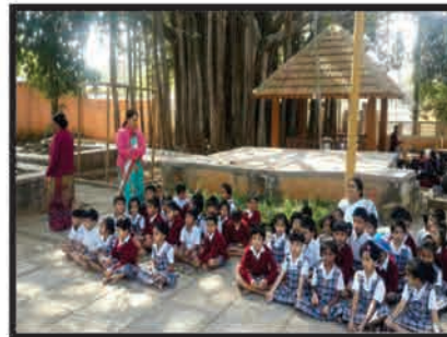
Our tiny tots in Divya Chaitanya