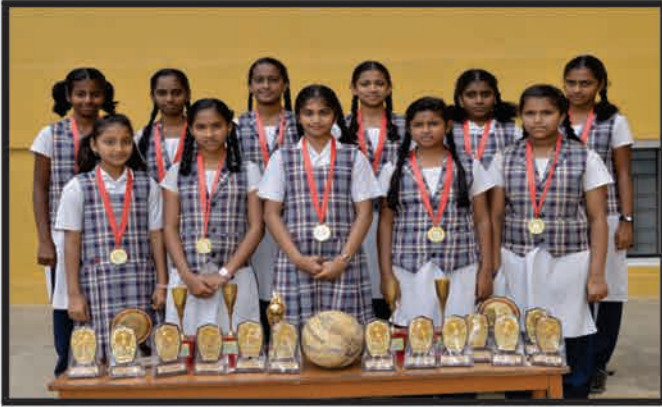
U-14 Girls Netball team State level winners